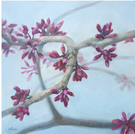
Redbud by Alia El-Bermani Oil on panel