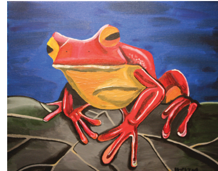
Rachel Hopkins '16 Acrylic on canvas

This show will feature work from sixth through eighth grade art classes. Included works will be sixth grade crayon etching, printmaking and drawing, while our seventh graders add mosaics, grid painting and a cross-disciplined study of multiculturalism represented in facemasks to the show. Rounding out the show will be eighth grade design projects, perspective drawings, silk paintings, and stained glass.