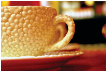
Rachel Landers '12 Digital print

The photography students from Photography I and AP Design will exhibit their work with a mixture of collage, pinhole imagery and digital photographs. The students will explore the historic beginnings of photography with pinhole cameras, through black and white film and contemporary imagery with digital cameras. Gallery opening TBA.