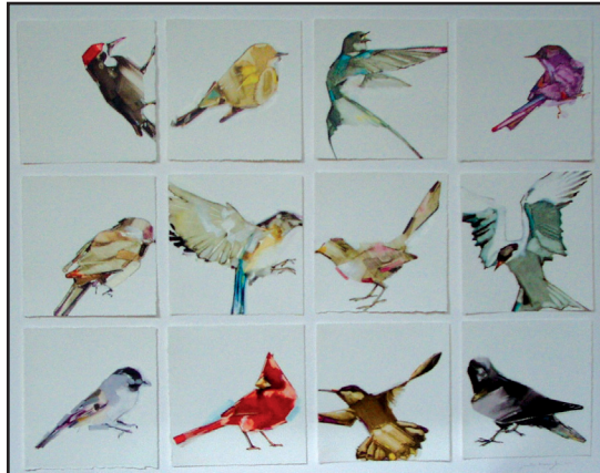
Janelle Howington Oil on paper Part of the permanent collection