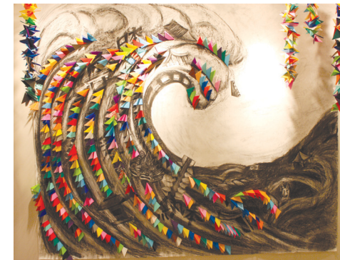
Tsunami , by AP Art Students '12 Charcoal on paper with origami