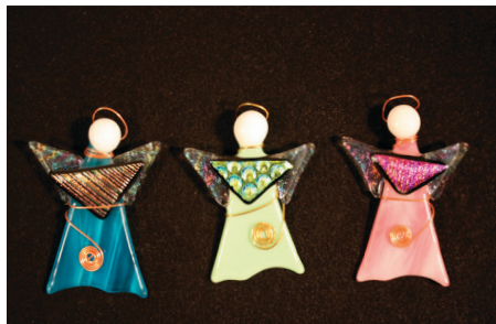
Angel pins Glass by Middle School Students